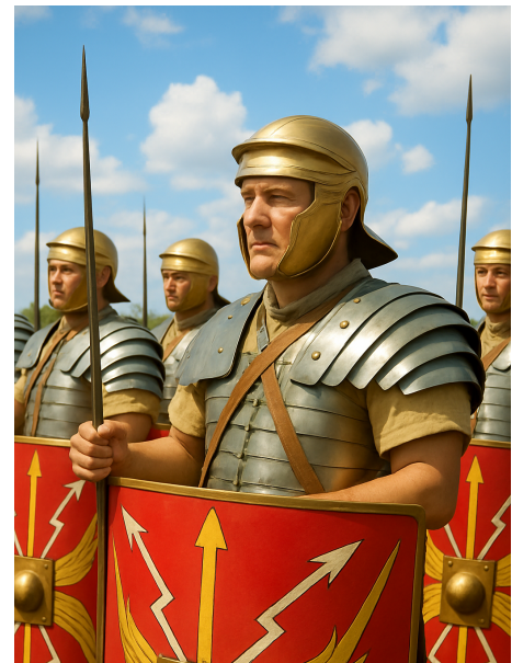
XII Legion Gold Helmet with flowing down 'hair'

FOR A NATION HAS COME UP AGAINST MY LAND, STRONG, AND WITHOUT NUMBER; HIS TEETH ARE THE TEETH OF A LION, AND HE HAS THE FANGS OF A FIERCE LION.