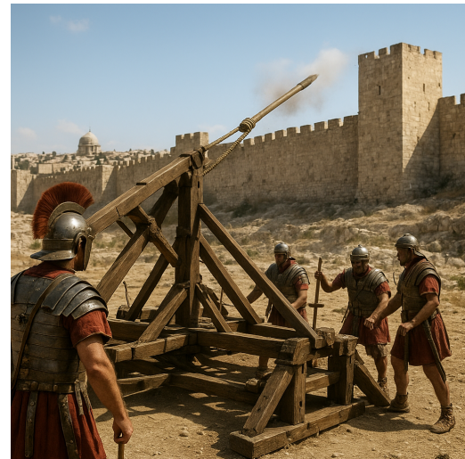
Roman Scorpion firing over the walls of Jerusalem

This is an excellent description of Roman weapons. In fact, one of the siege weapons is the Greek word 'scorpio,' which Revelation uses for "scorpion." It is called Scorpio in Greek, and the weapon shares the same name.